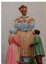
OUR LADY OF LASALETTE... Reconciler of sinners, pray without ceasing for us who have recourse to you.

WEEKLY OFFERING.....5/21.....$5,772.00 6/4 – School Support; 6/11 – La Salette Mission Appeal.